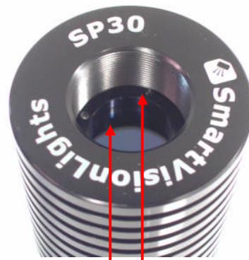
Pattern Retaining Ring