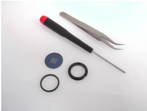
Tools: small screwdriver or tweezers

Projector was designed with integral extension tube to make all lenses focus at a shorter distance than inscribed on the lens focus ring because most projection distances are fairly short. To increase the focal distance a spacer ring is needed. The spacer is recommended when working distances of greater than 2 meters are needed.