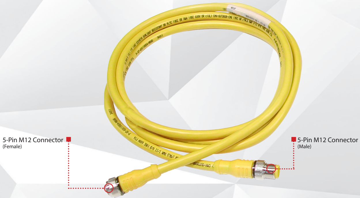
5-Pin M12 Connector (Female)