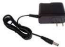
S75-SCB Standard AC Adapter (Included)