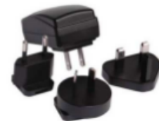
S75-SCB Universal AC Adapters