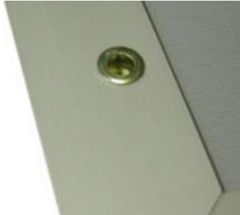
Threaded inserts in aluminum frame