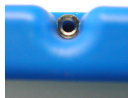
Figure 3. Correctly installed insert

Use 6 inserts/screws for a Linear light and 3 inserts/screws for a Brick light. Snug down screws to diffuser or polarizer. Over tightening screws can break diffuser/polarizer or inserts will begin to pull toward surface. Do not over tighten with excessive force. For added stability on a permanent installation, a thread locking compound may be used on the screw.