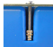
Figure 4. Correctly installed insert & screw

Diffuser and Polarizer Kits now include new inserts and screws.