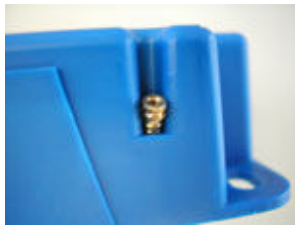
Figure 1. Insert at bottom of slot ready to be pushed in

Heating the insert with a heat gun will help with less force and an easier install. If heating is used, heat the insert. DO NOT heat plastic housing on the light.